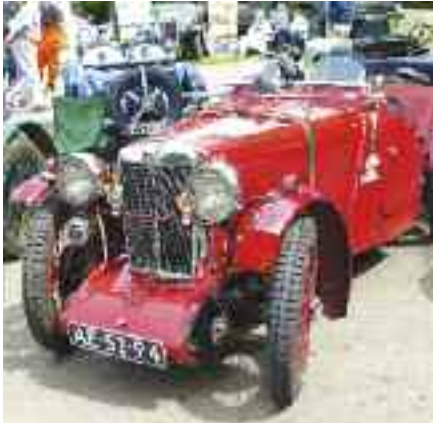
The Red one...Hans van den Bosch's cycle wing J2 (J.2676)