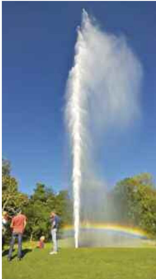
The spectacular fountain at Stanway