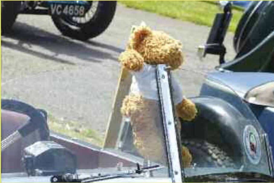
Tailpiece: Two more images from Pre-war Prescott.

The top photo shows a cute stowaway on Frank Ashley's much campaigned M-type, The lower photo shows a very elegant Colin McLachlan entering into the spirit of the event.