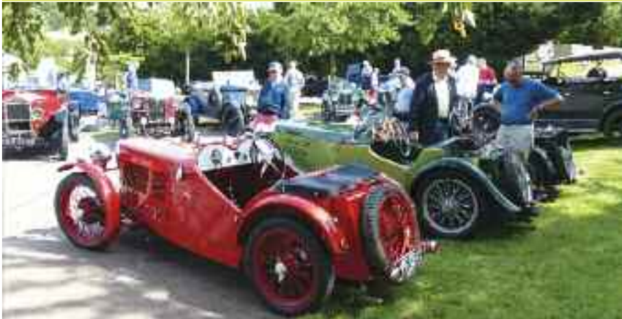
A sunny Saturday with Triple-M cars in the paddock at Prescott, what could be better?