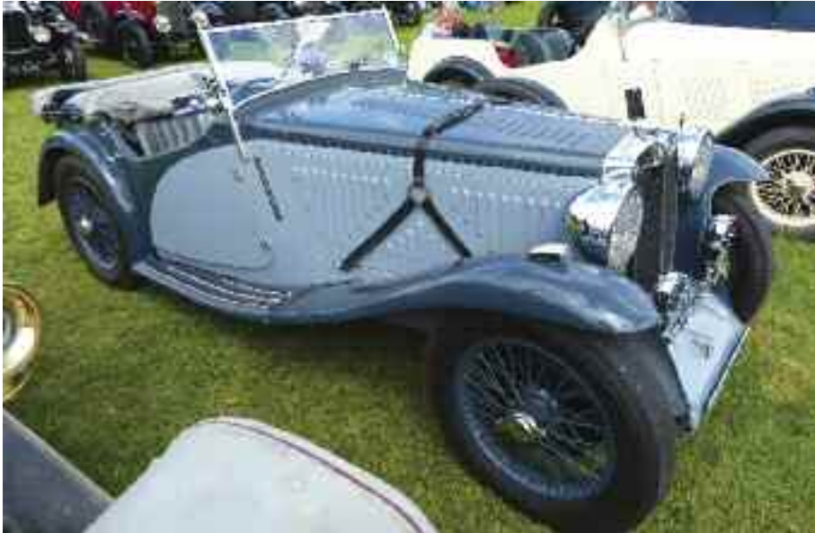
NA 0305 in the spectators' car park

The appeal of this event is not just the site, sound (and smell) of vintage cars tackling the hill but being able to wander amongst the amazing machinery in the paddock. The members' cars in the Orchard car park are a show in themselves and the trade stands are varied and fascinating.