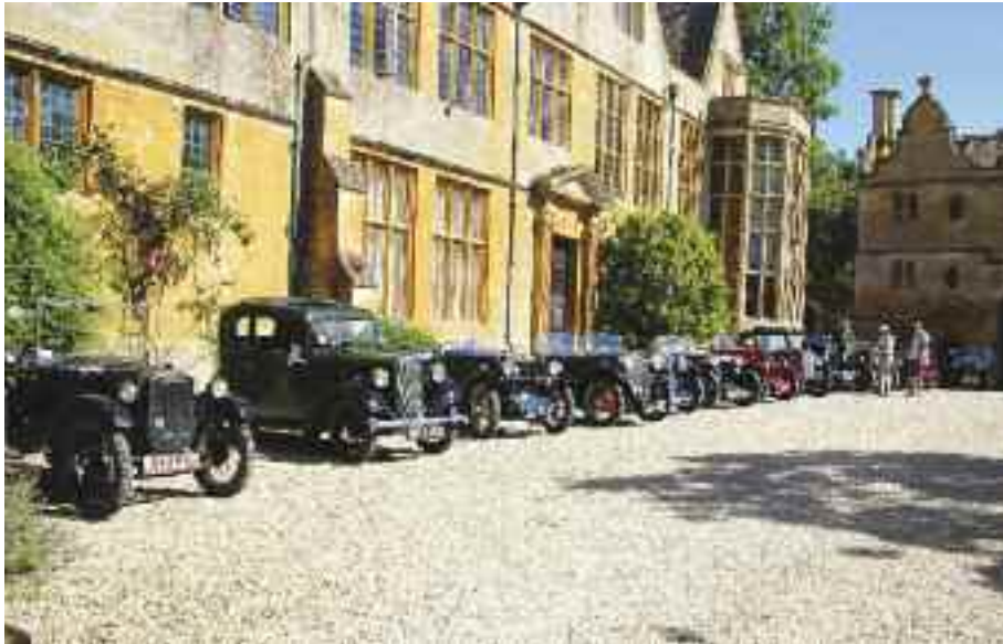
The Sunday run at Stanway House