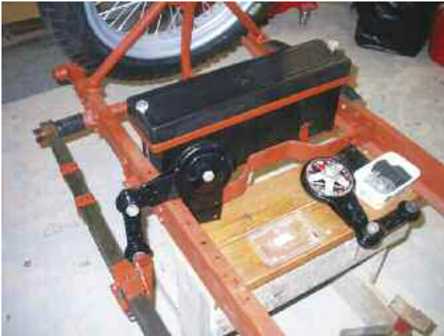
Fitting the modified bracket

Also, two steel torsional strengthening plates were welded to the bracket and drilled through with a 5/16 inch diameter drill. These plates can be of a thickness for packing to suit the required position of the shock absorber, or it may be found necessary to slot the holes in the bracket to achieve a correct working position for the damping unit.