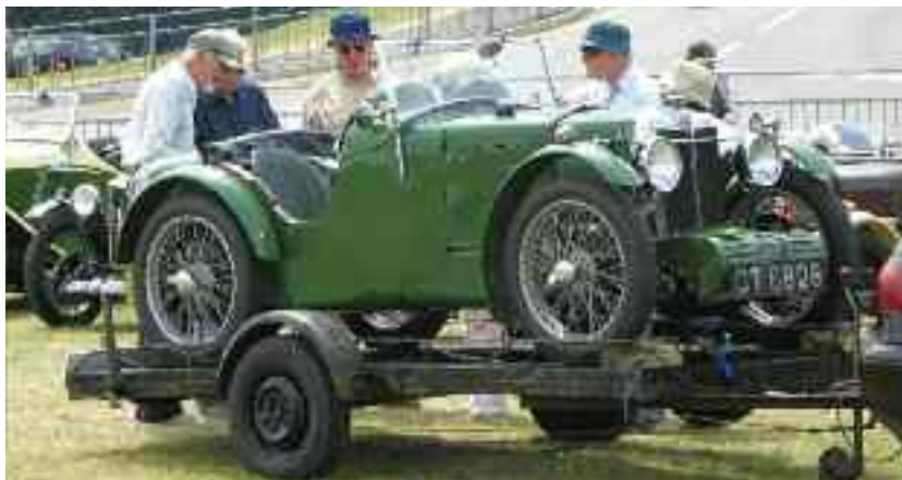
Silverstone 2006