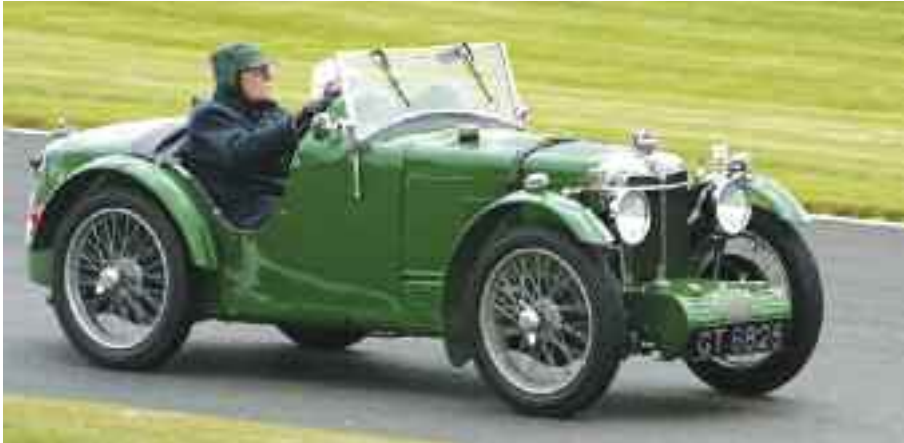
Oulton Park 2009