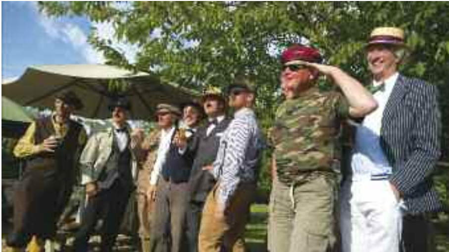
The Dutch visitors ready to party

Then! The big Battle of Britain Victory party with barbie, jazz band and a Hawker Hurricane! Us Dutchies had taken the 'Please, dress up!' A bit too serious apparently as it turned out only a tiny bunch had dressed up for the occasion! Perhaps we